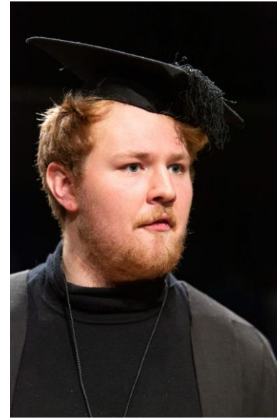
DARK SHADOWY FIGURE